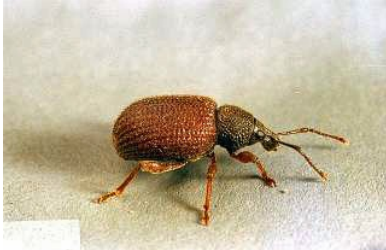
Rough strawberry root weevil (Ken Gray Collection)