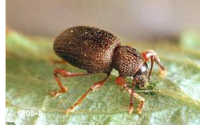
Strawberry root weevil (Ken Gray Collection)

Typical Location When Observed: Root weevils (black vine weevil, lilac root weevil, rough strawberry root weevil, and strawberry root weevil) are occasional nuisance invaders of homes.