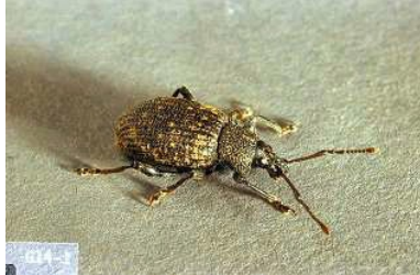
Black vine weevil